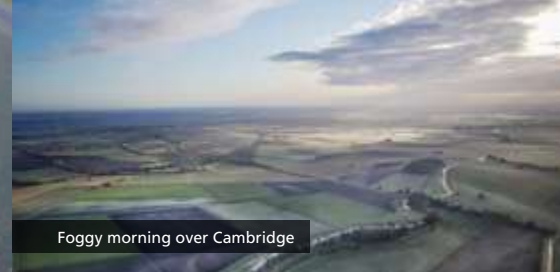
Foggy morning over Cambridge