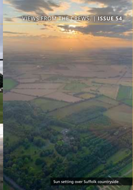
Sun setting over Suffolk countryside