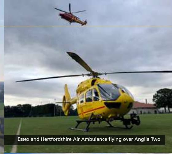
Essex and Hertfordshire Air Ambulance flying over Anglia Two