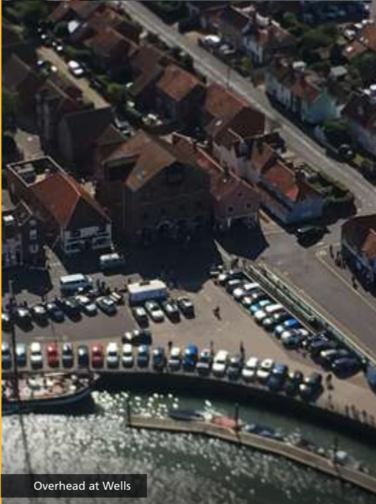
Overhead at Wells