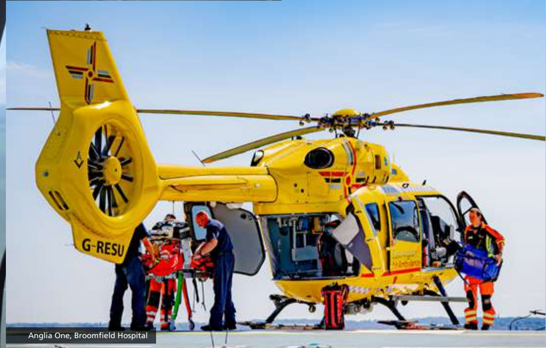
Anglia One, Broomfield Hospital