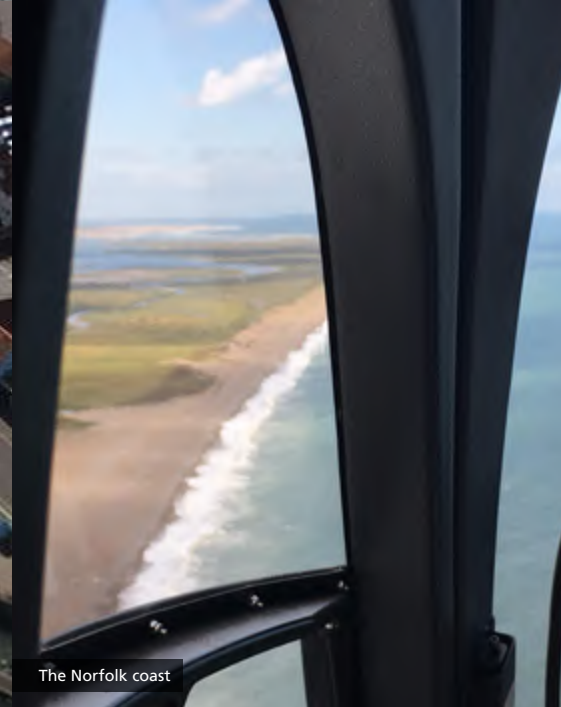
The Norfolk coast