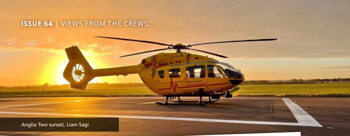
Anglia Two sunset, Liam Sagi