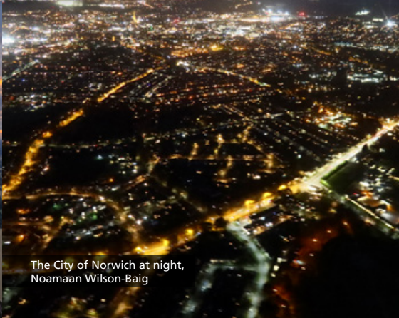
The City of Norwich at night, Noamaan Wilson-Baig