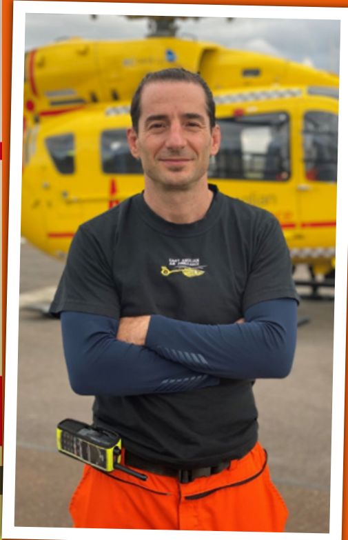
EAAA RAID group

This improved monitoring of blood pressure better informs the decisions made by our critical care paramedics and doctors. Since its implementation, 66 patients have benefited from this procedure.