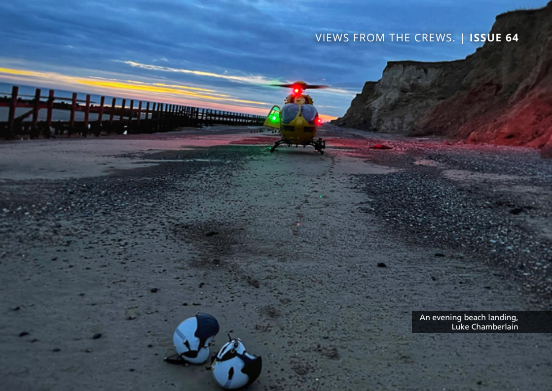
An evening beach landing, Luke Chamberlain