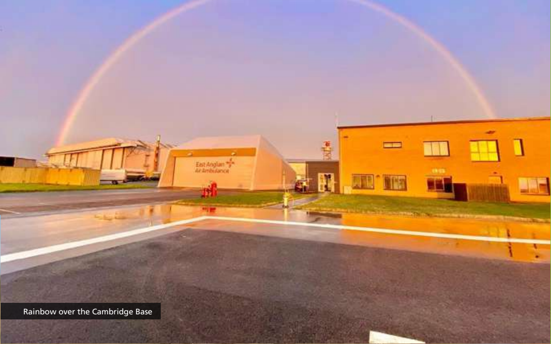
Rainbow over the Cambridge Base