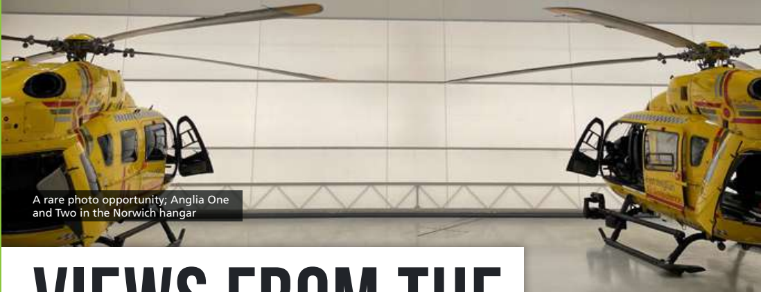
A rare photo opportunity; Anglia One and Two in the Norwich hangar