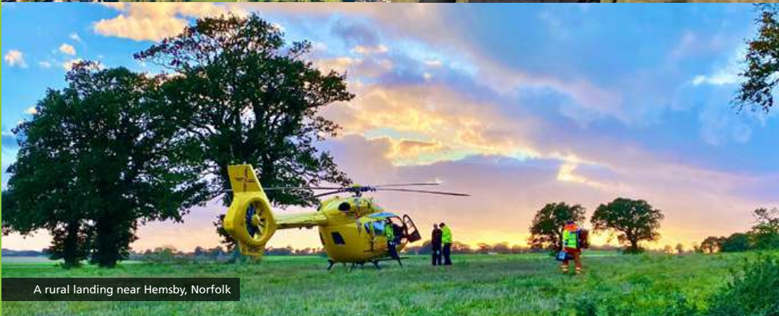
A rural landing near Hemsby, Norfolk