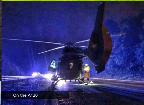
On the A120