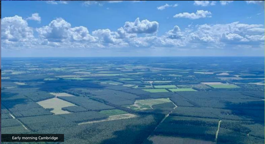
Early morning Cambridge