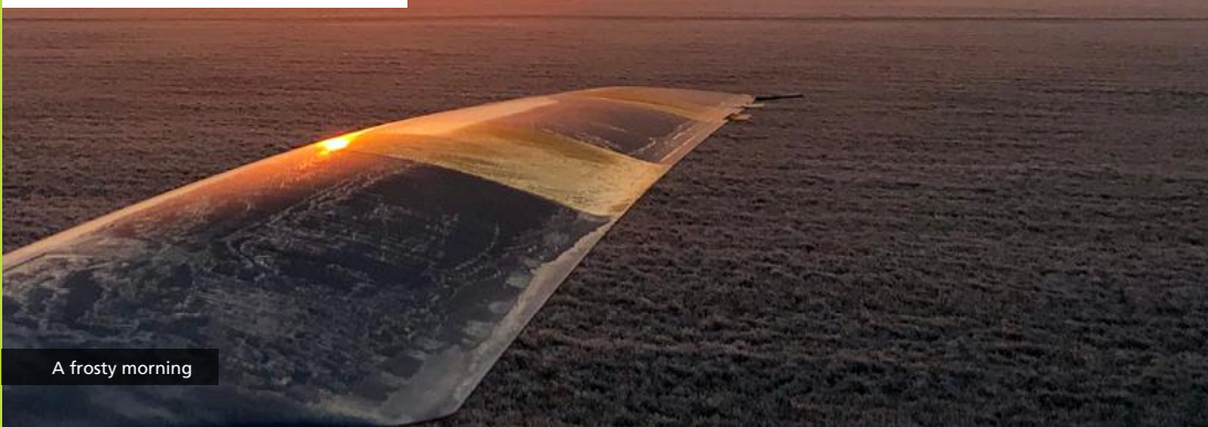
A frosty morning