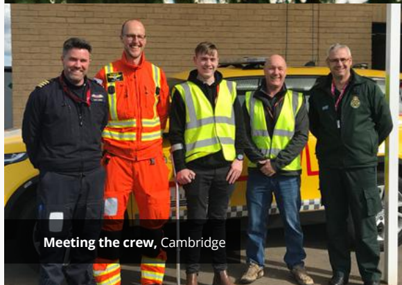
Meeting the crew, Cambridge