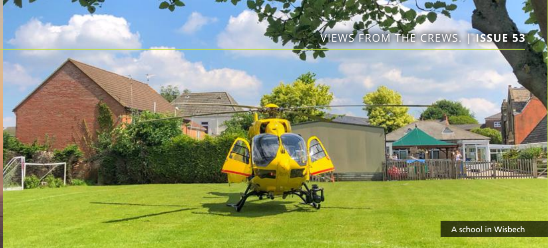
A school in Wisbech